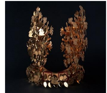
A gilt bronze crown