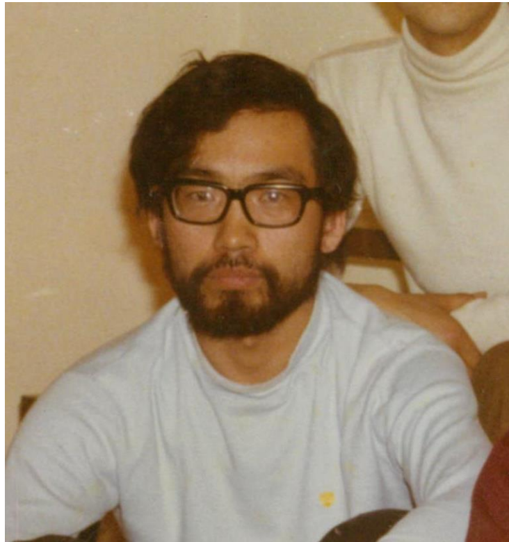
Syracuse N.Y. in 1971