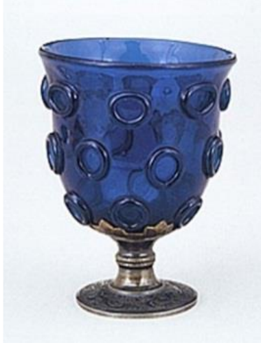
A cup of lapis lazuli