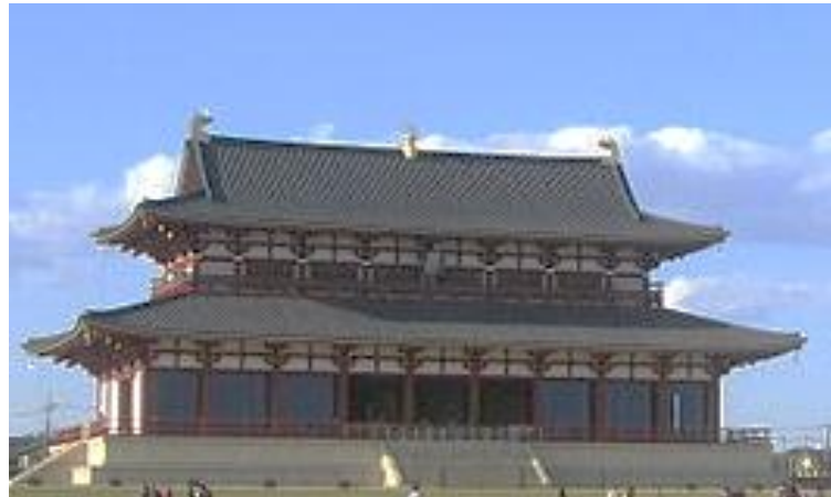
The State Council Hall (now rebuilt at the original site)