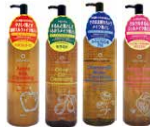
Qulenzia 500mL (3 types)