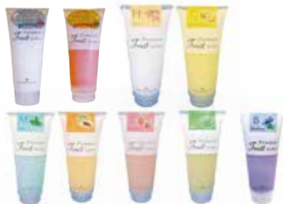
Premium Fruit Sorbet (9 types)