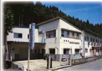
View of the main office

En no Gyoja: The founder of Shugendō religious tradition, and supposed inventor of Daranisuke.