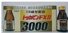
Tockapin FX II