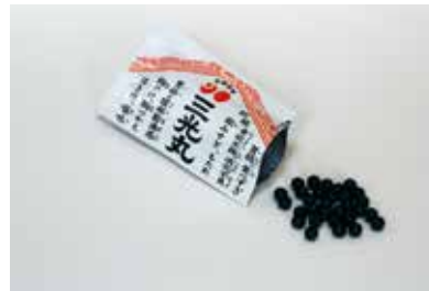
Sankogan(A box contains 6 bags.)