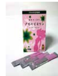
Agave Inulin granules