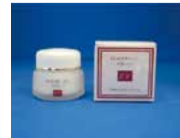
Placenta EX Cream