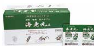
Kairo-gan A (Wakan digestive medicine)