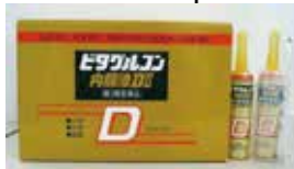
Vitagulucon Oral Liquid D II