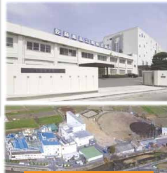
View of the main office