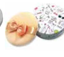
Club Airy Touch Powder