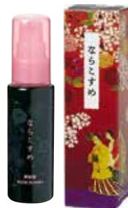
Nara Cosme Essence

通信販売0120-508-369 http://club.cosmeonline.com