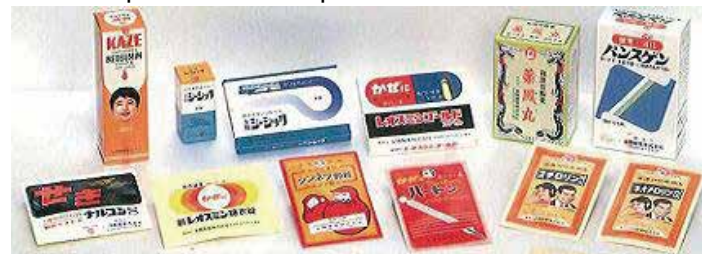
Examples of our medicines from the 1970' s