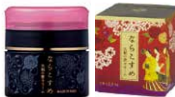
Nara Cosme Yamato-no-Megumi Cream