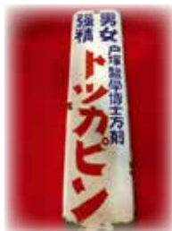
Old enameled signboard

Since its beginnings, the company has mainly produced oral liquid medicines and nutritional drinks. At present, the company' s main office and 2 GMP factories produce nutritional drinks, bath salts, health foods and more. With a history of over a half century, we are determined to achieve ever higher quality and new product development.