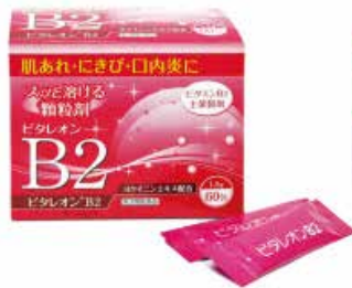
Bitaleon B2 (including coix extract; remedy for rough skin, acne, mouth ulcers)