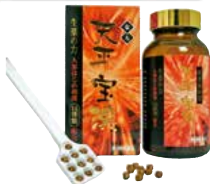
Tempyo-Hogan (revitalizer with 14 kinds of natural remedies)