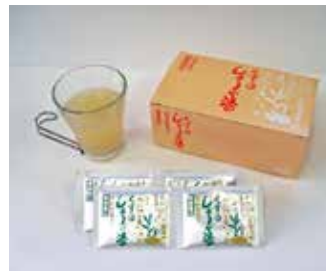
Ginger tea with Yoshino Kuzu (pueraria root)