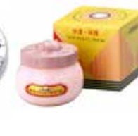
Kurabu Horumon Cream