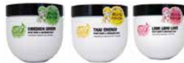
Super Smoothie 550g (3 types)