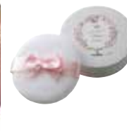
Club Suppin Powder