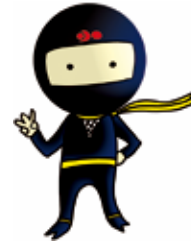
Mascot character: Sankogan

We produce and sell Sankogan, a Wakan (traditional Japanese) digestive medicine. The origin of this medicine dates to about 700 years ago. It is said that the name "Sankogan" was given by the Emperor Godaigo in the 14th century. At our Sankogan Museum of Pharmacy, visitors can learn free of charge about Kampo and traditional medicine from Nara.