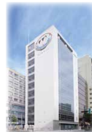
View of the main office