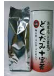
Dokudami Juho Tea