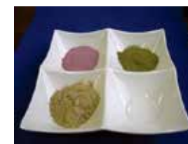
Yamato Toki Angelica leaves and peony flowers