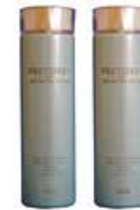
PRETURE Face lotion and moisturizer