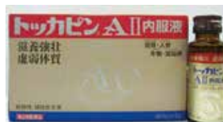
Tockapin A II Oral Liquid