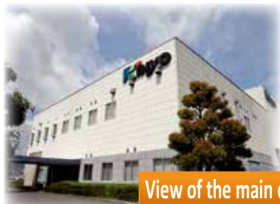
View of the main office