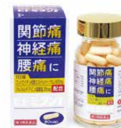
Hitomitan f (for joint pain, neuralgia, backache)

<Inquiries> 株式会社ホーエイが運営するサプリの館 ( http://hoeisupple.shop25.makeshop.jp/ ) で販売中。