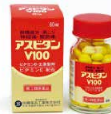
Asbitan V100 (main formula: Vitamin B1, effective for stiff muscles)