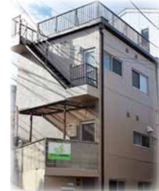
View of the main office

Stanley Pharm started in Nipponbashi, Osaka, as a wholesaler dealing mainly in the natural ingredients for medicines. It also had a shop called the “Yamato Pharmacy” which sold Daranisuke-gan, Wakan and Kampo medicines, health foods and more. Today, it is based in Ikoma City, Nara, and engaged in developing and selling products with natural ingredients such as the leaves of Tendai-uyaku (lindera) and Yamato toki (angelica).