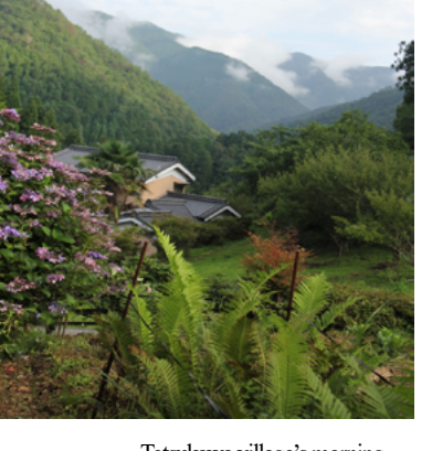
Totsukawa village's morning