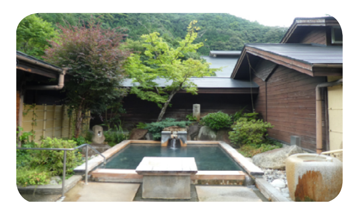
One of the open air baths in hotel 'Subaru'