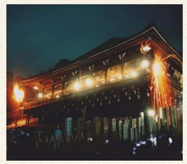
Tōdai-ji Temple Shuni-e taimatsu torches

An event held by priests known as Rengyōshu for two weeks from 1 March, when various rituals devoted to happiness and well-being are performed which, at times of national disasters, epidemics, and strife, will help overcome these afflictions, and ensure 'protection for the state', 'peace', 'benign seasonal weather', 'bountiful harvests', and 'joy for all'. Commonly referred to as 'Omizutori, at dawn on the 13 March, water known as O-Kōzui (sacred water) is drawn from the Wakasa-i Well and dedicated to the main image. And, to light the way for the Rengyōshu priests conducting the ceremony, every evening during Shuni-e from 1 to 14 March, O-Taimatsu torches are hoisted aloft.