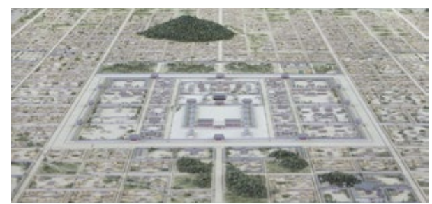
Bottom left Model of Fujiwarakyō Top right Panoramic view of the Fujiwara Palace site

The Fujiwara-kyō layout was based on the Chinese city grid pattern. Which