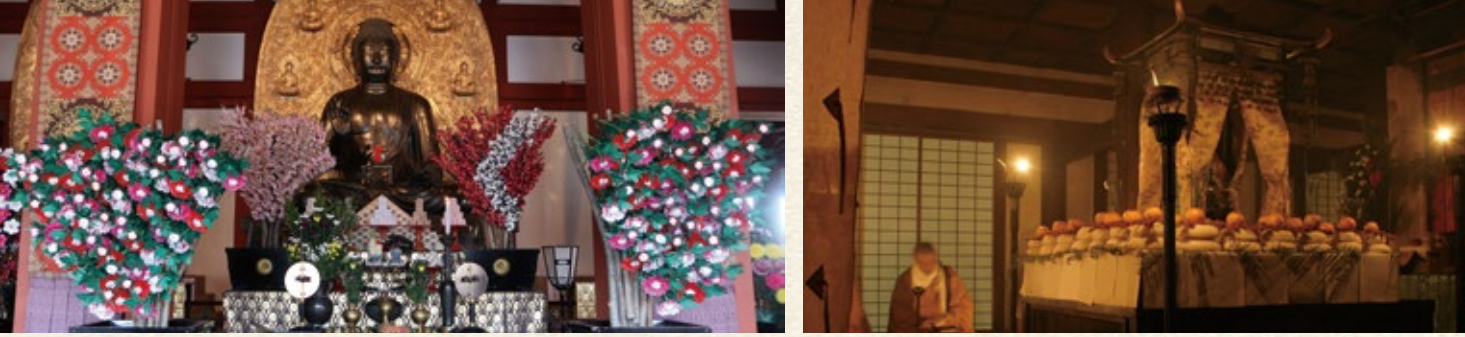
Yakushi-ji Temple Hana-eshiki