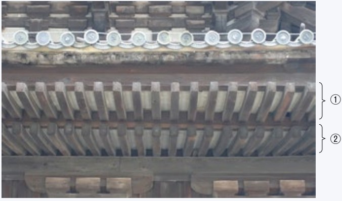
Kohfuku-ji Temple five-storey pagoda rafters

Looking at the ends of the rafters of the five-storey pagoda, completed in 1426, one sees that short rafters above are rectangular, but the lower base rafters have rounded corners, and are elliptical. It is thought that this is because in ancient times the shape of the base rafters was round, and work in the Middle Ages copied the design of the old architecture.