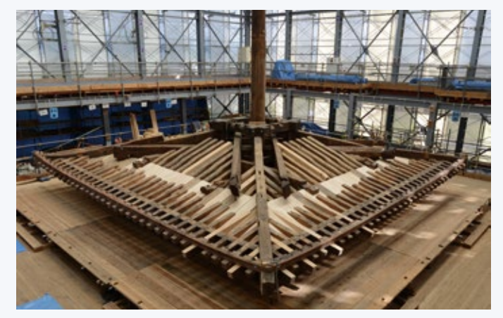
Yakushi-ji Temple's East Pagoda disassembly and repairs

Most of the buildings constituting the 'Historic Monuments of Ancient Nara' are on their original sites. It has been judged that all the constituent properties were sited, and remain, within Heijōkyō, the old 8th century capital of Japan's environment.